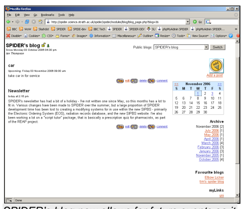
SPIDER's blog now allows for future events so it can be used as a calendar

The blog tool on SPIDER has been updated to allow users to modify the posting date, so that it can also be used as a calendar by posting items on future dates. The blog home page has also been tweaked - student users can now access their "favourite blogs" (any other user's public blog can be made a favourite), and staff get a quick link to their counsellees PDP and public blogs. The blog tool can be added to a cluster by the admins using the "customise" option in the admin tools.