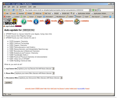
Auto-update of classes and filters makes it easier for new users to start using SPIDER

SPIDER now allows student users to autoupdate their myClasses list as well as their news and discussion filters, based on the classes stored in either their myDegree (if set up) or from the class lists. All users still have the option of managing their my-Classes list manually if they wish.