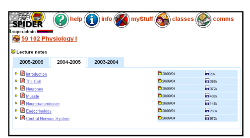
content 'session tabs' under the "lecture notes" heading

delay a file's appearance until after a lecture or other relevant time, or to be hidden from view after a deadline date has passed. How SPIDER differs is that each file also has an "active for session" option, which defaults to the current academic session (e.g. 2005-06). The heading under which the file is displayed is organised into different session "tabs", allowing an archive of content to be built automatically. By default, all users can access any "ses-