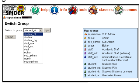
user group switcher tool

The open nature of SPIDER means that generally speaking, all users see most of the same things in classes and other parts of the system. However, sometimes staff have the requirement to see the site exactly as a student would, as certain tools and features are only visible or available to other user groups. In the past, staff could simply request a second account, or a shared departmental, temporary student account was created. This will no longer be required, as the new user group switcher tool allows any staff user to temporarily become a member of any group with lesser access privileges. This means admin level users can switch to any user group, and regular staff can become any of the different student groups. They can then view SPIDER exactly as if they were a a user in that group. From within the group switch tool page, users simply select the group they wish to become, and click "go".